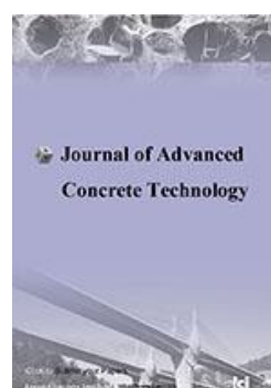
<Journal of Advanced Concrete Technology>